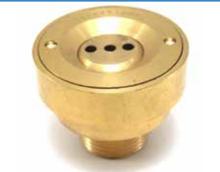
TriStream Jet Nozzle Flush Mounted to the Deck. Interchangable for Multible Effects WMD115