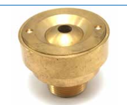
Stream Jet Nozzle Flush Mounted to the Deck. Interchangable for Multible Effects WMD100